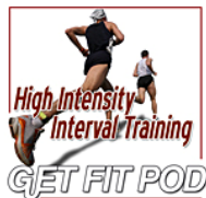
Episode 149 08/01/10 Advanced HIIT For Runners

CURRENT GET FIT POD HIIT WORKOUTS (EARLIER GET FIT POD HIIT WORKOUTS ARE AVAILABLE AT GETFITPO.COM)