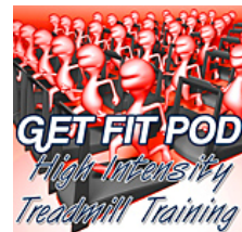
Episode 137 04/25/10 HIIT Treadmill Workout